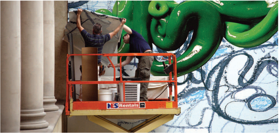
Installation in progress.