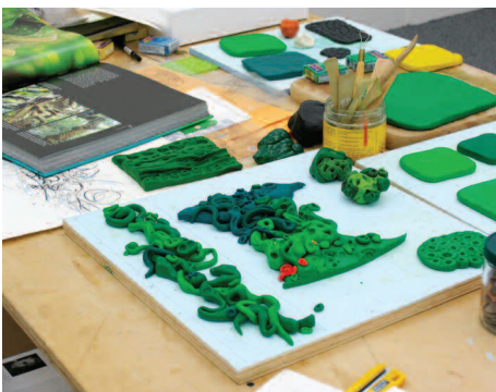
Studio table, 2006.