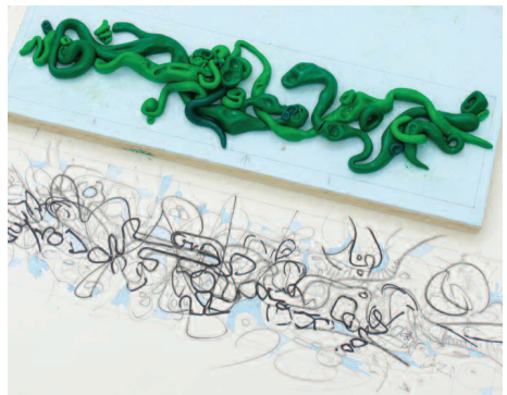
Clay model and drawing in studio, 2006.

The image started in typical fashion as a 14.5-inch model sculpted in oiled clay, 8 but what followed was an ink and crayon drawing made directly in response to the sculpted form. Using digital photographs of each, Ross superimposed the images on the computer to arrive at the final composition. He collaborated with commercial printers using inkjet technology to print the mural to scale (in 17 vertical panels), which was installed wallpaper style on site.