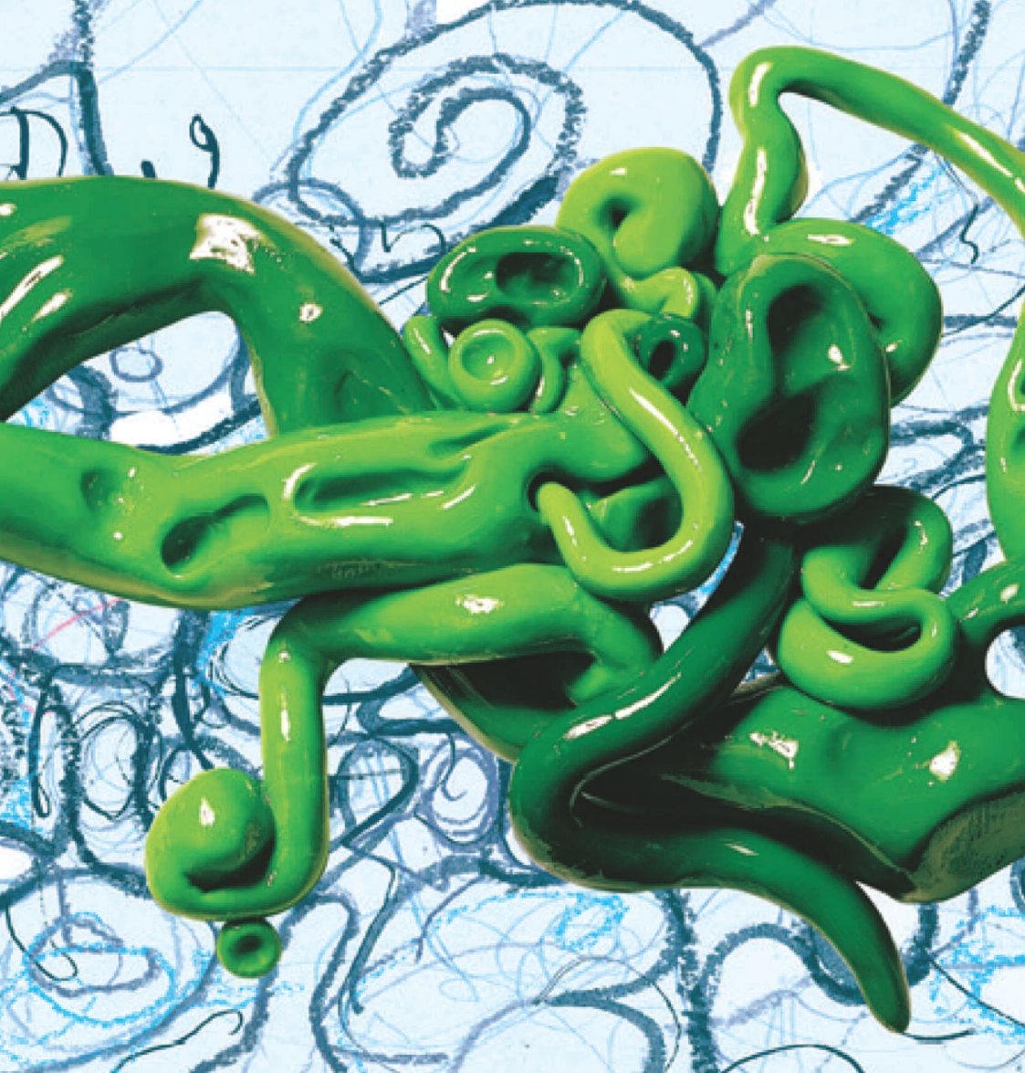
Untitled, 2007, inkjet on paper, 17' x 67'. Courtesy of the artist and Marianne Boesky Gallery