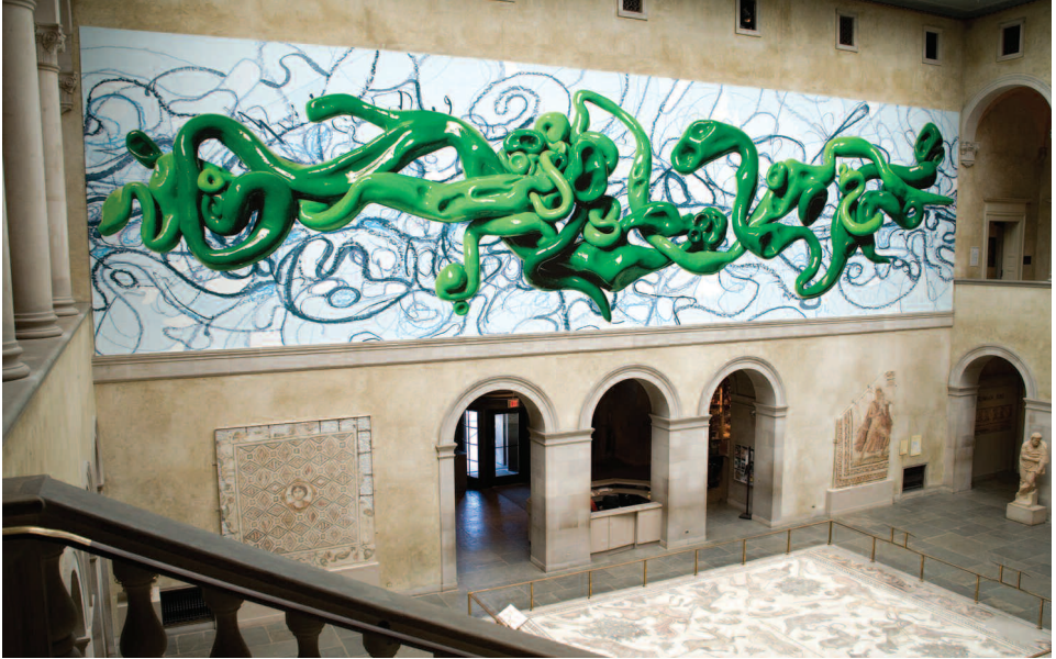
Installation view of Renaissance Court.