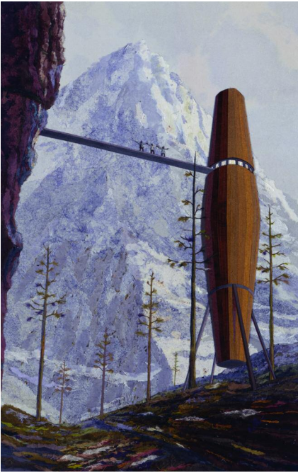
Life is Splendid , 2000, paper cut out, 31 x 21 inches, Collection of Laura Steinberg and B. Nadal-Ginard.

Thorpe's intimately scaled images often depict dramatic, imaginary landscapes that are loosely based on representations of the American West—scenes of wilderness not experienced firsthand by Thorpe but inspired by the literary and visual accounts of others. Mountain peaks, towering pines, and vast skies become the settings for futuristic architectural dwellings—bunkers, watchtowers—that suggest loneliness, self-sufficiency, and solitude. These structures range from the sci-fi “rocket-ship” in Life is Splendid and the omniscient “eye” of House for Auto-Destiny , Imaginative Research , to the more organic and pre-industrial crafted buildings in Good People or Militant Lives . In Pilgrims , helicopters close in on three hexagonal structures overhanging a cliff. Sometimes groups of tiny figures stand nearby, dwarfed by the vastness of their surroundings. Similarly, Thorpe positions us below and at a distance, where we are left to marvel but also contemplate whether the apparent mystery spells peril or possibility.