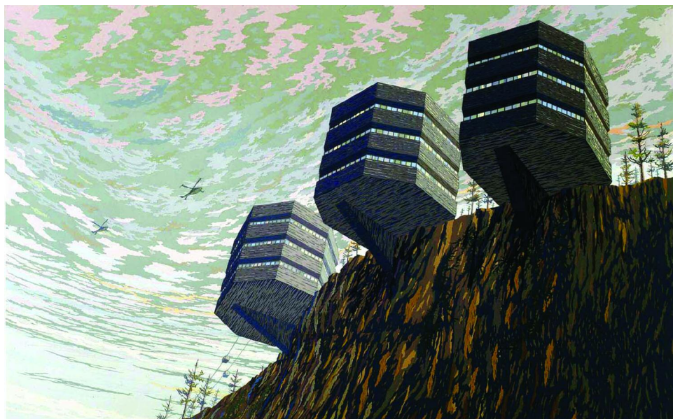
Pilgrims , 1999, paper cut out, 46 x 68 inches, Collection of Laura Steinberg and B. Nadal-Ginard.