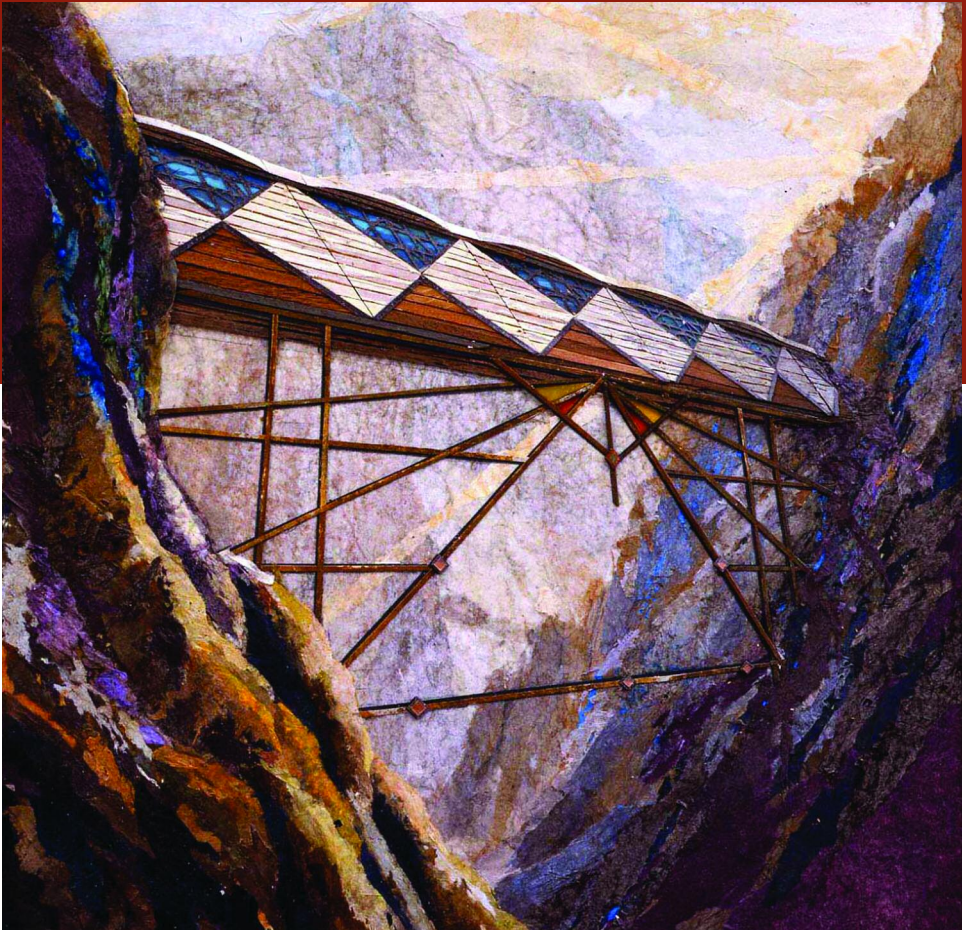
Militant Lives , 2002, mixed media collage, 14 x 14 inches, Private Collection, London.

Installed together, the historic paintings and Thorpe's image worlds present a complex picture of the relations between the domestic and the wilderness, between the appeal of solitude and the need for community. Thorpe's inclusion of his Arts and Crafts-inspired screen, handmade of painted glass and dark wood, extends pictorial connections between subject, scale, and time into the architectural environment of the gallery. Its horizontal expanse, signifying both intellectual boundary and physical barrier, strategically separates the Museum's historic